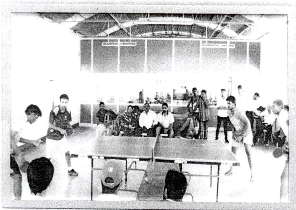
During the match of Table Tennis Tournament-2017